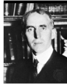
HISTORIAN CHARLES BEARD CLAIMED THE FOUNDING FATHERS WERE MORE CAPITALISTS THAN SAGES.

Beard claimed the founding fathers were less sages than they were capitalist opportunists. “The whole theory [the economic interpretation] rests upon the concept that social progress in general is the result of contending interests in society— some favorable, others opposed to change,” Beard wrote. According to Beard, it is important to find out which socioeconomic groups might have benefited by such a drastic change in the old system as the Revolution and the Constitution proved to be. Beard goes on and on in his work pointing out the types of people who would be open to “revolution.” These groups were well represented at the conventions that governed the Revolution and included mortgaged farmers, landed debtors, and Western speculators and opera-