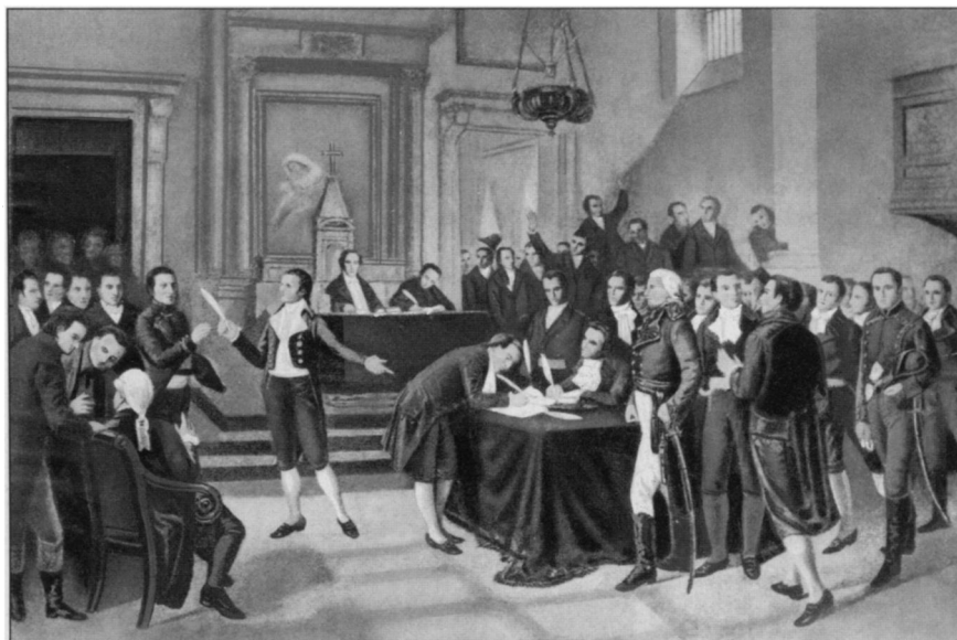
Miranda and Bolivar lead their followers in signing of the Declaration of Independence for Venezuela against Spanish rule, July 5, 1811.

The records of the Continental Congress confirm that the need for a declaration of independence was intimately linked with the de-