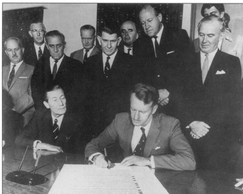
Rhodesia Declares Independence. Ian Smith, Rhodesian Premier, signs declaration of independence (top photo from files), as Rhodesian officials watch, November 11, 1965.

in the fifteenth century all the way to the Wilsonian promise of self-determination in the early twentieth (11). Likewise, Ho Chi Minh's Declaration opened with quotations from the second paragraph of the American Declaration and the French Declaration of the Rights of Man. Ho Chi Minh, long an admirer of George Washington, thereby placed the Vietnamese revolution into a longer revolutionary tradition while also making a shrewd, albeit unsuccessful, bid for American support for Vietnamese independence (12). Even these examples, however, were not typical in their respect for the Declaration's "self-evident truths." More characteristic of the century before the Universal Declaration of Human Rights (1948) was British foreign