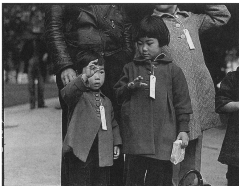
These two little girls, wearing ID tags which bear the number that was assigned to their family, are waiting in the Oakland, California, train station to be taken to an "assembly center."

The day after the Imperial Japanese government's devastating attack on Pearl Harbor, President Franklin D. Roosevelt, in his war message to Congress, declared that the day of the attack, 7 December 1941, would be "a date which will live in infamy" (1). Seventy-four days after the attack, 19 February 1942, he issued Executive Order 9066, which became the authority for the United States Army to exile nearly 120,000 persons of