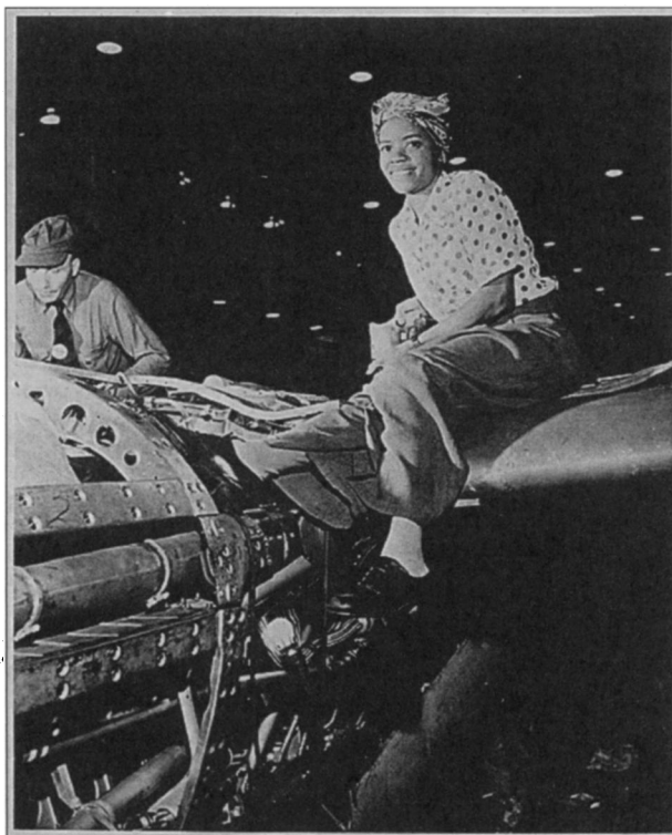
Riveter at Lockheed Aircraft Corporation, Burbank, California, ca. 1940-1945.

These letters are honest accounts, written "at the scene" and "from the heart" for a limited audience and with little idea that historians such as ourselves would one day be interested in their