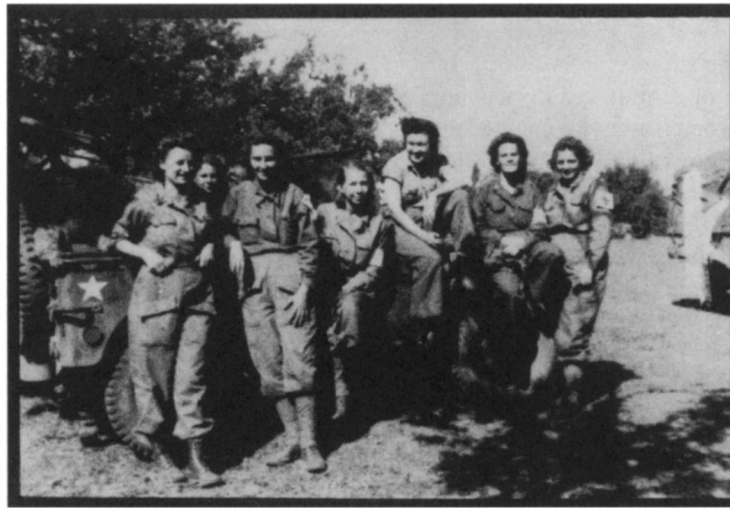
Army nurses assigned to a field hospital arrive in France on 12 August 1944.